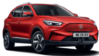
DYNAMIC RED TRI-COAT PAINT*

*Tri-coat and metallic paint optional at extra cost.