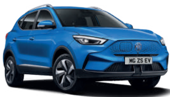
BRILLIANT BLUE METALLIC PAINT*