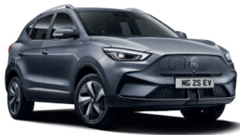
MONUMENT SILVER METALLIC PAINT*