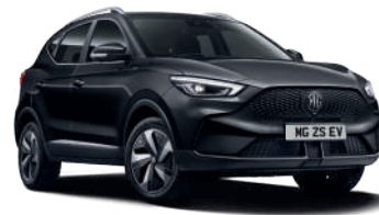
BLACK PEARL METALLIC PAINT*