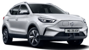
ARCTIC WHITE STANDARD PAINT